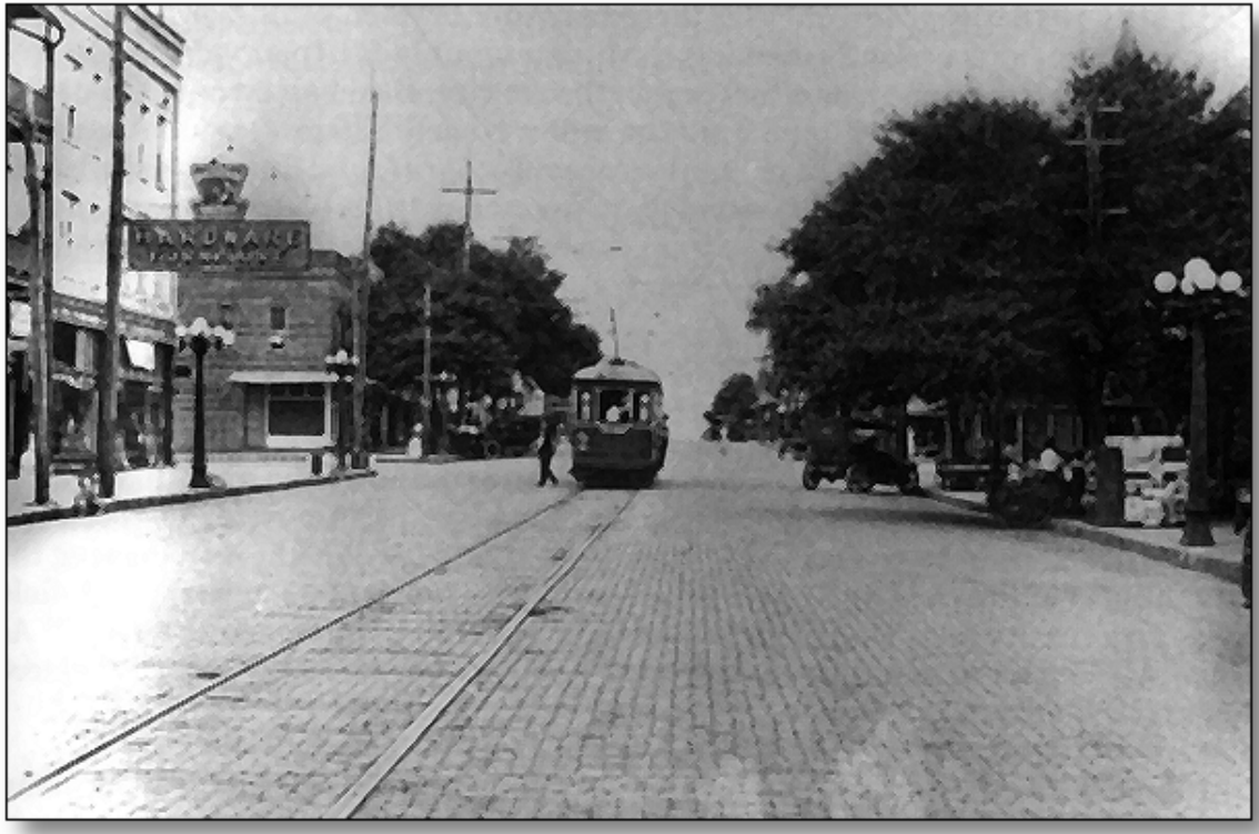
St. Petersburg's Central Avenue in 1916.