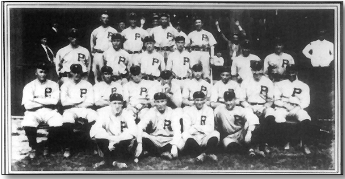
The 1915 pennant-winning Philadelphia Phillies.

Photograph from The Ultimate Baseball Book edited by Daniel Okrent and Harris Lewine.