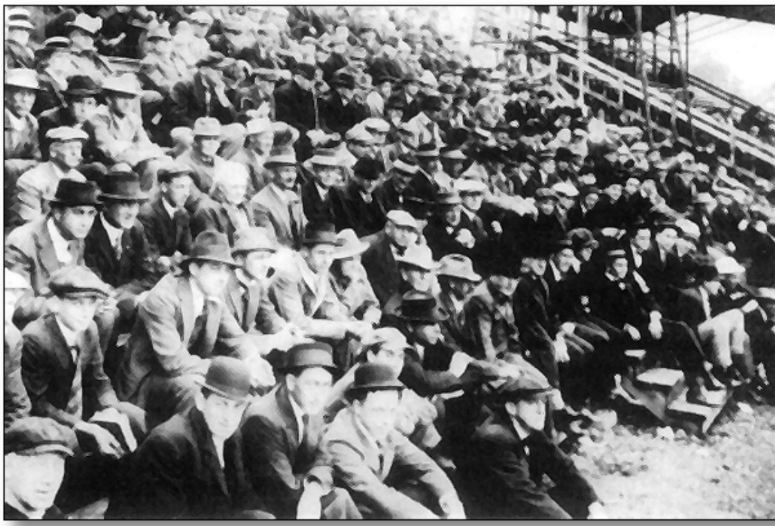
Fans at Sunshine Park watching a game between the Philadelphia Phillies and the St. Louis Browns in February 1915.